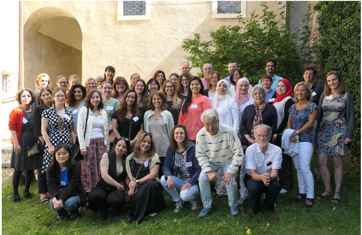
Participants and faculty members of the 2018 course at Goldrain castle.